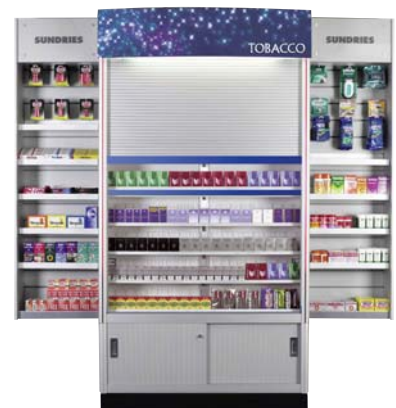
Point of Sale